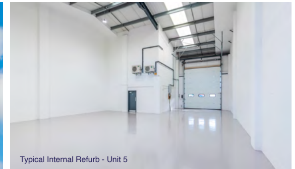
Typical Internal Refurb - Unit 5